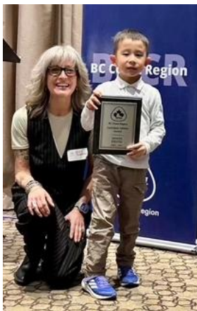
Canskater of the Year