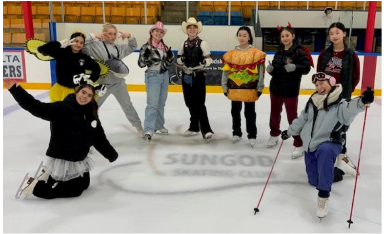
Our Fabulous CANSKATE Coaches