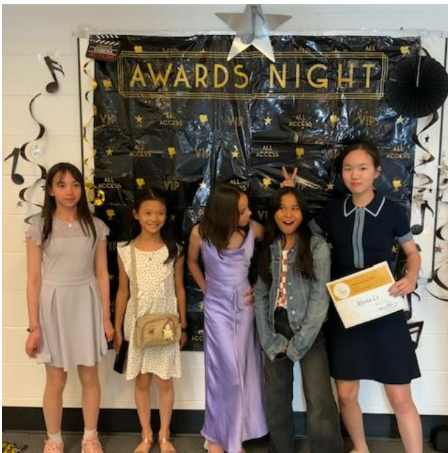
Shining Stars Awards Banquet 2024