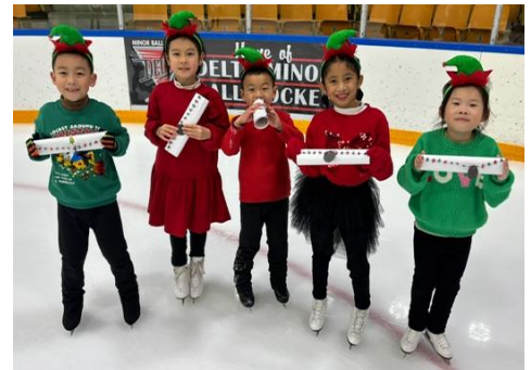
Xmas Recital 2024