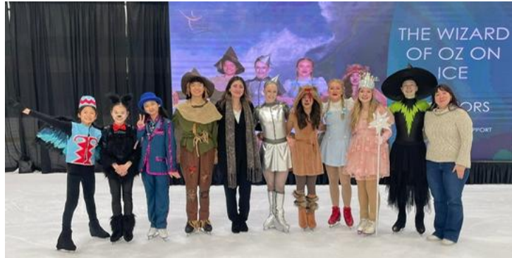
The Wizard of Oz on Ice