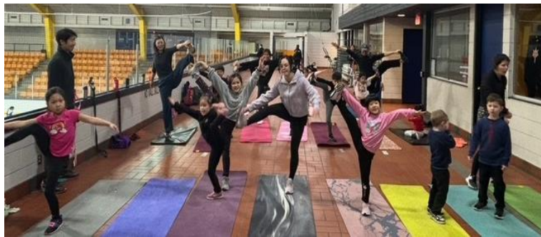
Parents Day in the Academy Off-Ice