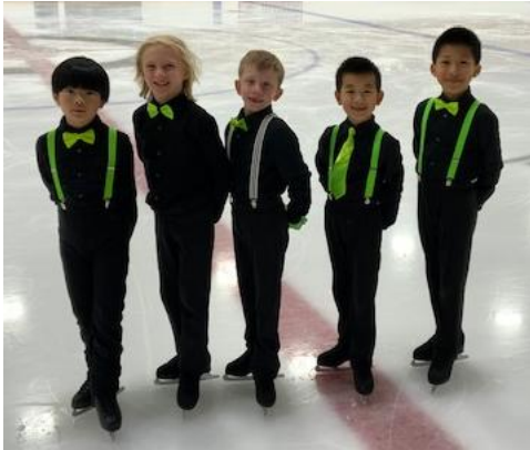
The Next Generation of Patrick Chans