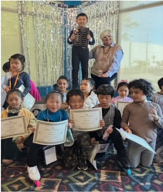
Norma Grant Academy Competition