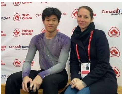
Skate Canada Novice Nationals