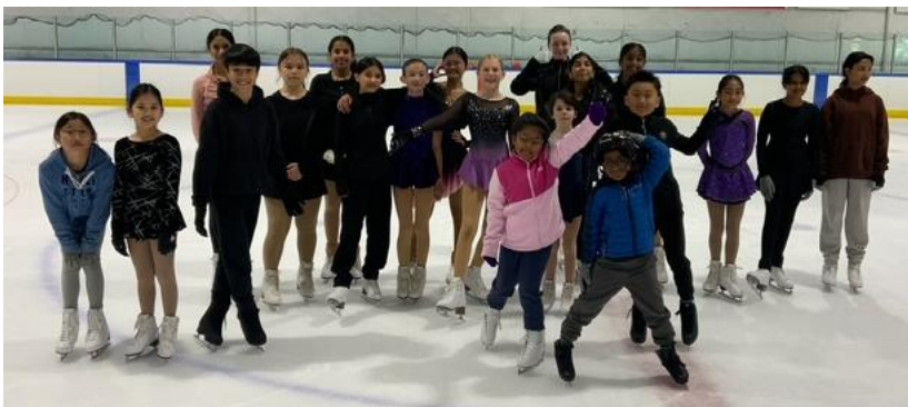
Academy 3 Club Competition