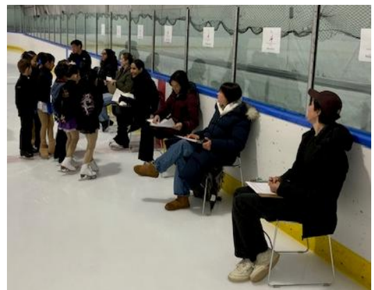
Pre-Star 1 Junior Club Competition