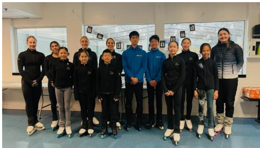
Sectional Team 2025 Send Off