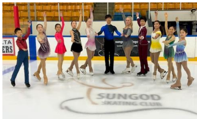
Sectional Team 2025